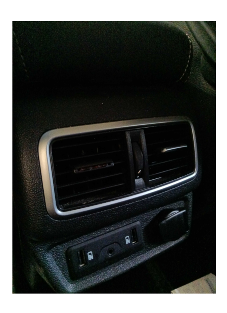
4. INSIDE: Trims - condition