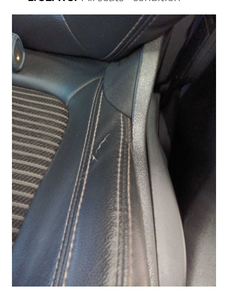
1. SEATS: All seats - condition