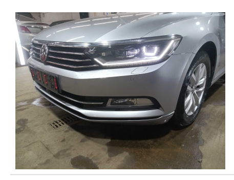
3. FRONT: Front grill - condition