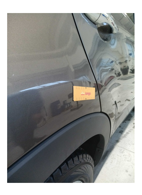
4. SIDE: Left and right side - visual damage / scratches