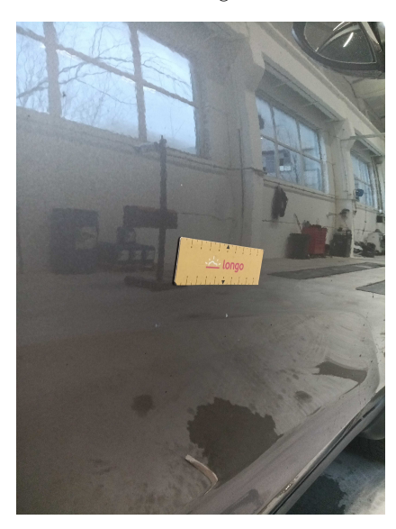
5. REAR: Rear bumper - condition and alignment