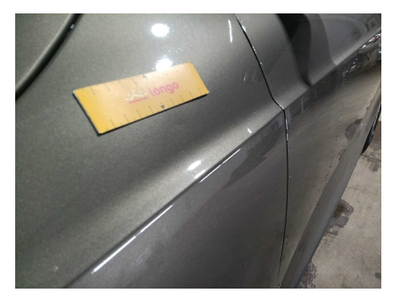
4. SIDE: Left and right side - visual damage / scratches