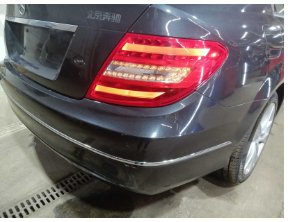
3. REAR: Trunk - visual damage