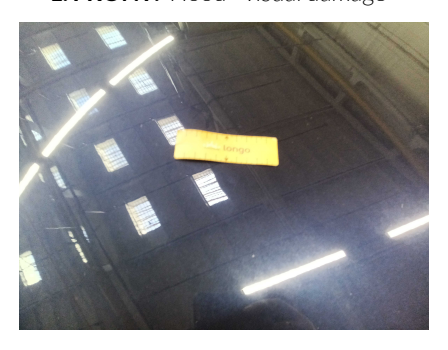
1. FRONT: Hood - visual damage