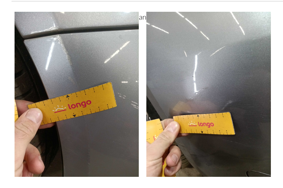
5. FRONT: Hood - visual damage