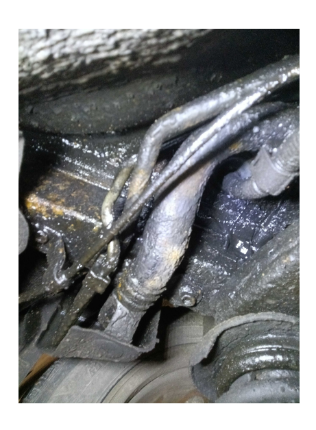
2. OTHER: Change tyres