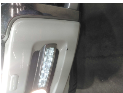
3. REAR: Rear bumper - condition and alignment