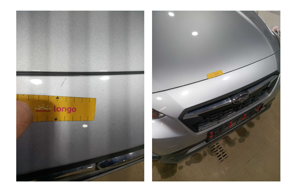
4. FRONT: Front bumper - condition an