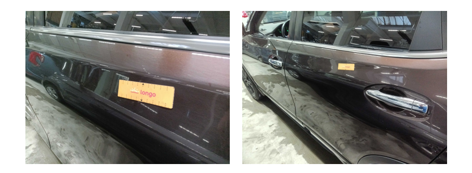
4. SIDE: Left and right side - visual damage / scratches