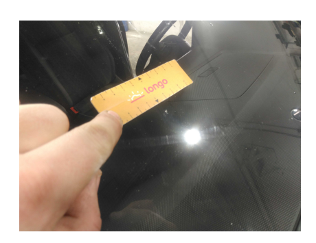
3. SIDE: Left and right side - visual damage / scratches