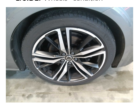
1. SIDE: Wheels - condition