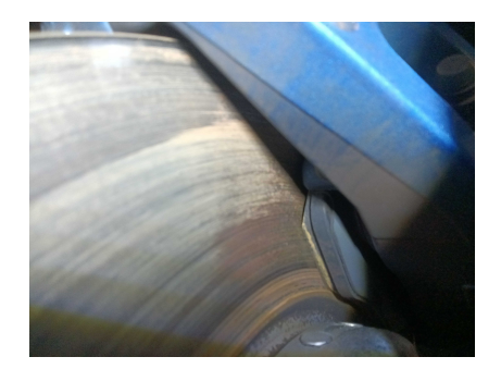
1. BRAKES: Front brake pads (all)