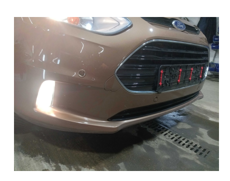
2. FRONT: Hood - visual damage