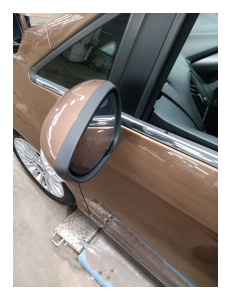
2. DOORS: Door rubber

1. DOORS: Exterior side mirrors - electronic mirror controls, folding and adjustment mechanism