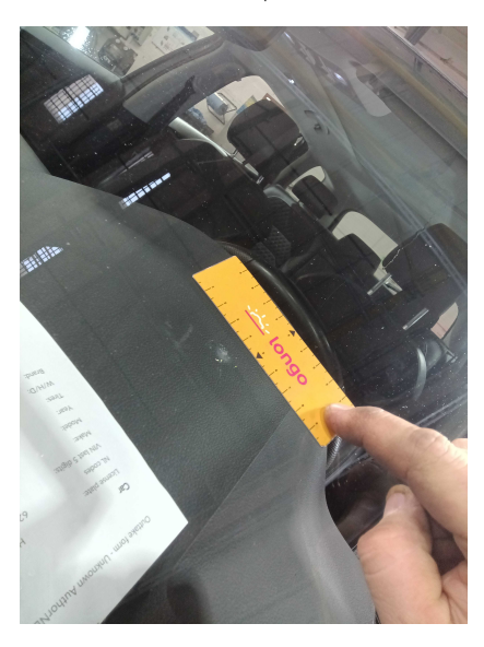
2. OTHER: Additional polishing tasks