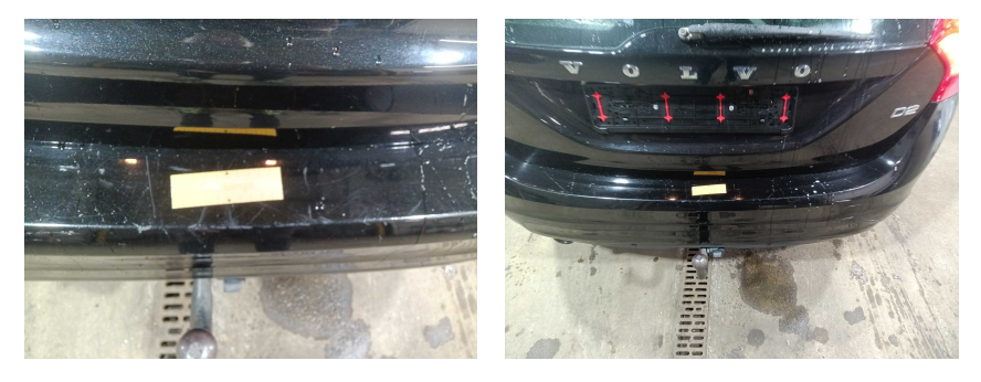
1. REAR: Rear bumper - condition and alignment