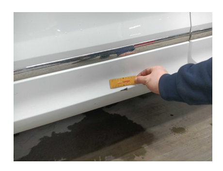
5. SIDE: Left and right side - visual damage / scratches