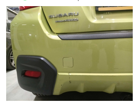
Paint rear bumper