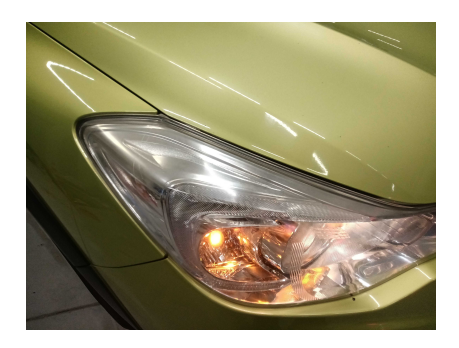
Change bulb for headlights