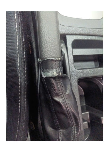
4. INSIDE: Trims - condition