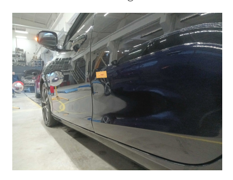
2. SIDE: Wheels - condition

1. SIDE: Left and right side - visual damage / scratches