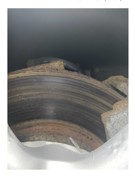
3. BRAKES: Rear brake disc (both)