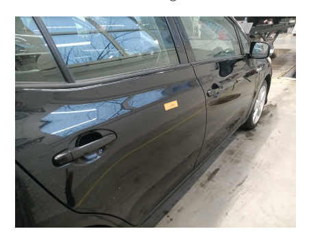
2. SIDE: Left and right side - visual damage / scratches

1. SIDE: Left and right side - visual damage / scratches