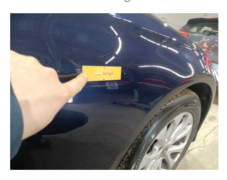
2. FRONT: Front bumper - condition and alignment

1. SIDE: Left and right side - visual damage / scratches