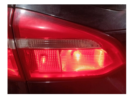
2. REAR: Trunk - visual damage

1. LIGHTS: Rear lights (brake, fog, indicator) - basic functioning, damage, color