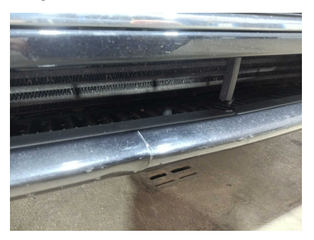
2. FRONT: Front grill - condition