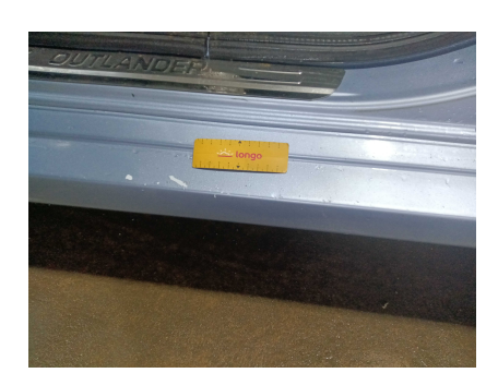
5. SIDE: Left and right side - visual damage / scratches