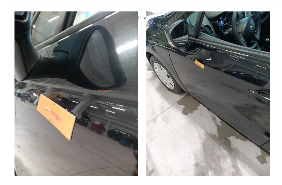
4. SIDE: Left and right side - visual damage / scratches