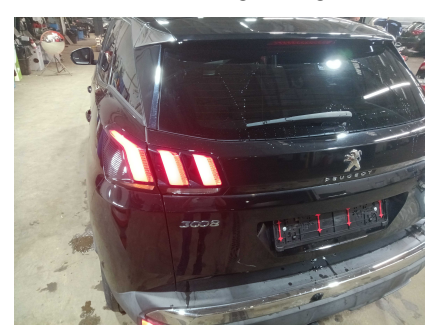
2. REAR: Trunk - visual damage