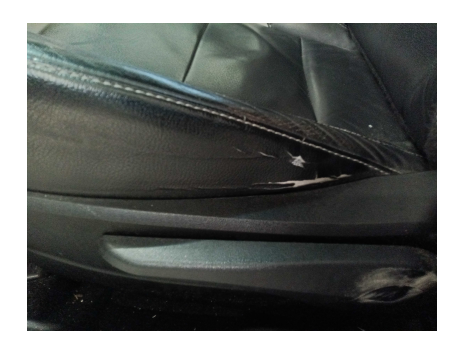
1. SEATS: All seats - condition