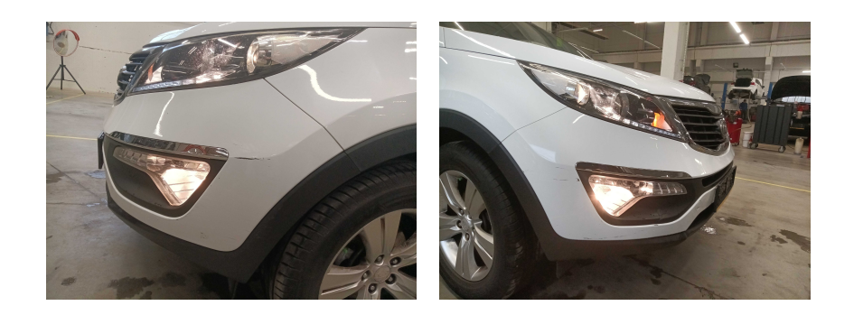
2. SIDE: Left and right side - visual damage / scratches