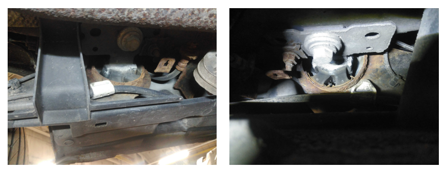
1. SUSPENSION: Trailing/semi-trailing arm (both)