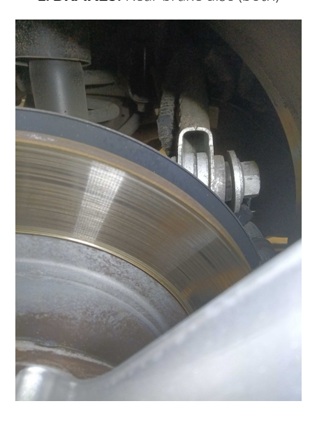
2. BRAKES: Front brake disc (both)