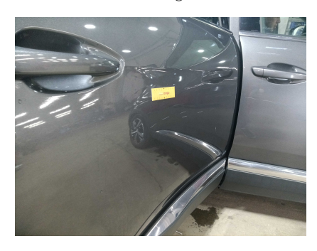
4. SIDE: Left and right side - visual damage / scratches

3. SIDE: Left and right side - visual damage / scratches