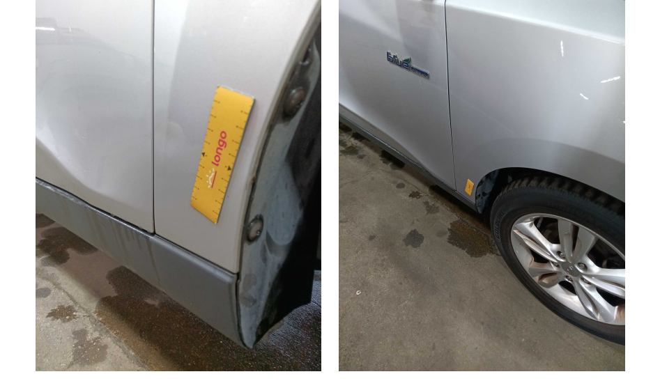
4. SIDE: Wheels - condition