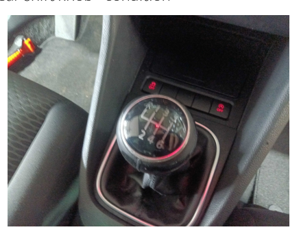
2. INSIDE: Trims - condition