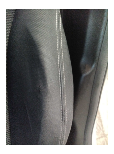
4. DOORS: Trims - condition