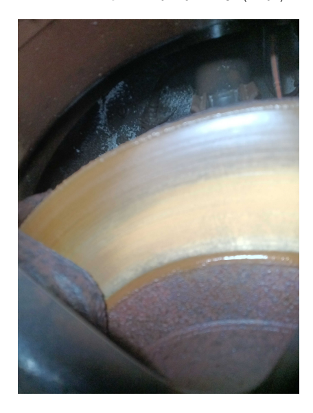
2. BRAKES: Front brake disc (both)