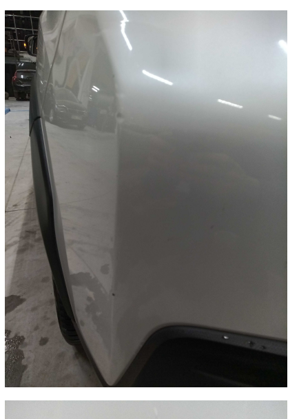
1. REAR: Rear bumper - condition and alignment