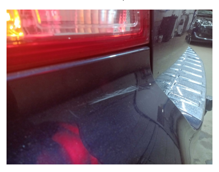
1. REAR: Rear bumper - condition and alignment