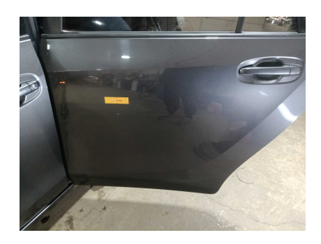
6. SIDE: Left and right side - visual damage / scratches