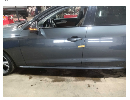
2. SIDE: Wheels - condition