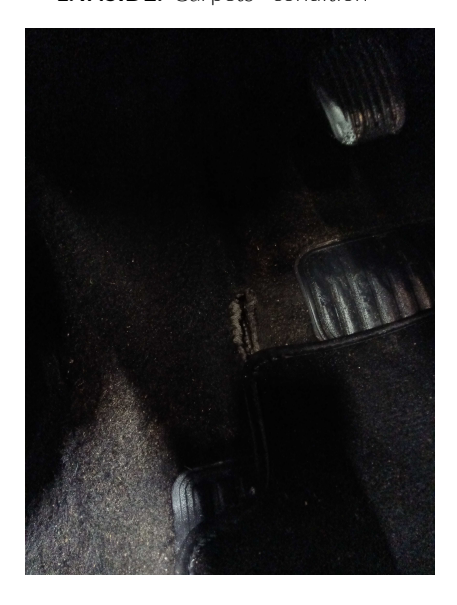
1. INSIDE: Carpets - condition