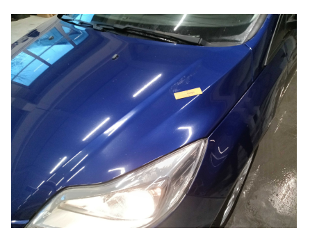
3. FRONT: Hood sound insulation for condition