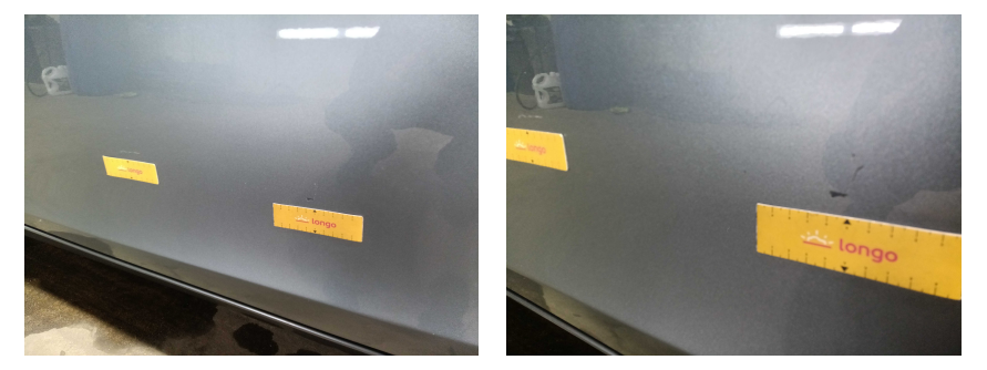
2. SIDE: Left and right side - visual damage / scratches

1. SIDE: Left and right side - visual damage / scratches