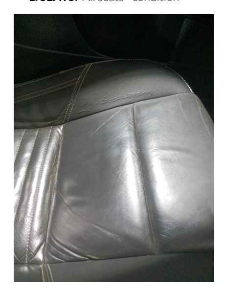
1. SEATS: All seats - condition