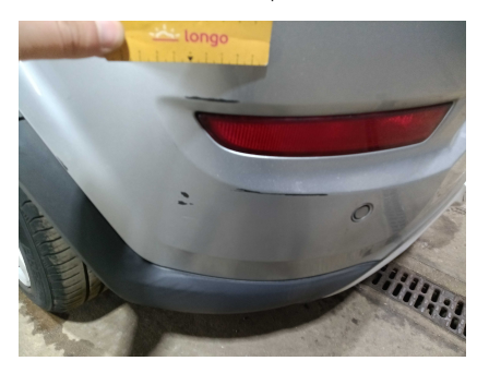
1. REAR: Rear bumper - condition and alignment