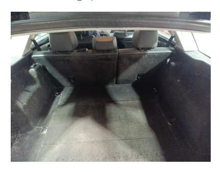
2. SEATS: All seats - condition