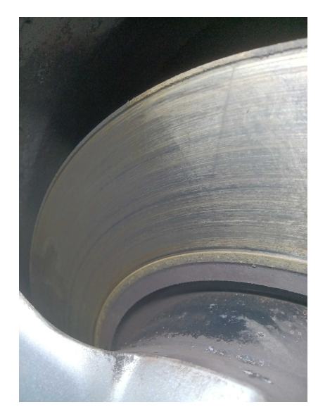
1. BRAKES: Front brake disc (both)