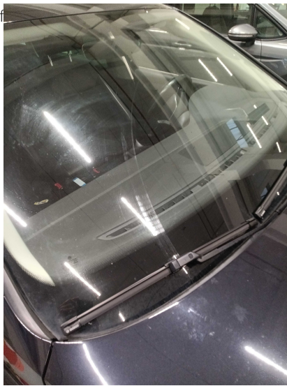
reference vehicle from MOT test