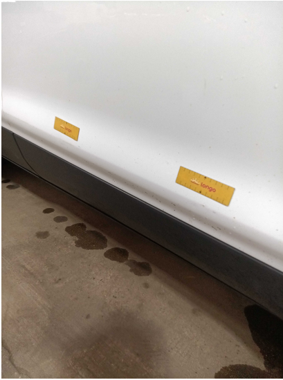
9. SIDE: Left and right side - visual damage / scratches