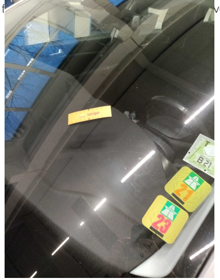
vehicle from MOT test