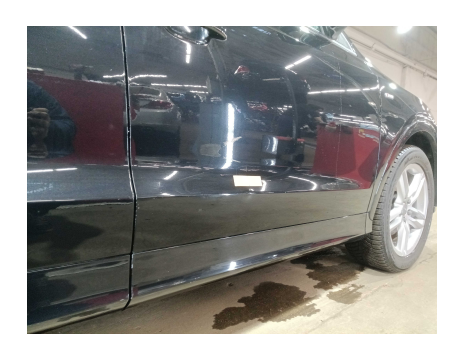
5. SIDE: Exterior mirrors - integrity of mirror itself and attachment to car