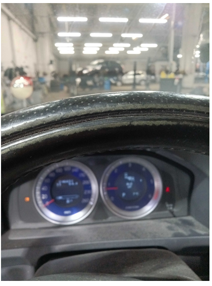
4. FRONT: Steering wheel - condition