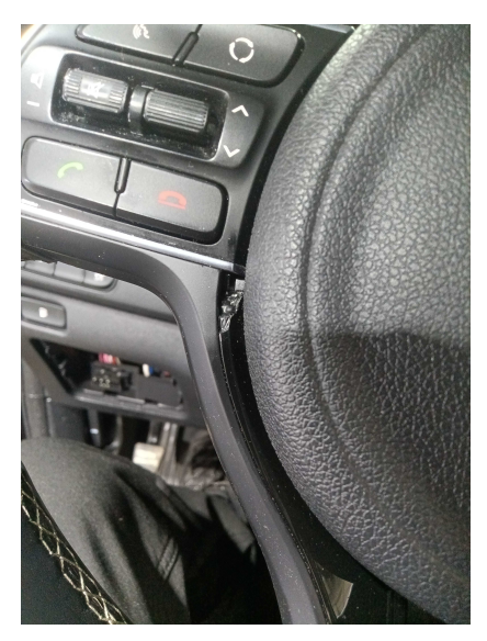
2. FRONT: Steering wheel - condition