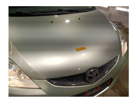
3. FRONT: Front bumper - condition and alignment